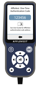
Verify PIN characters.

5. In the AffloVest app, select “search” to find your AffloVest. A 6-digit pairing code will be displayed on both the controller and the AffloVest app. Verify that the PIN characters are a match.