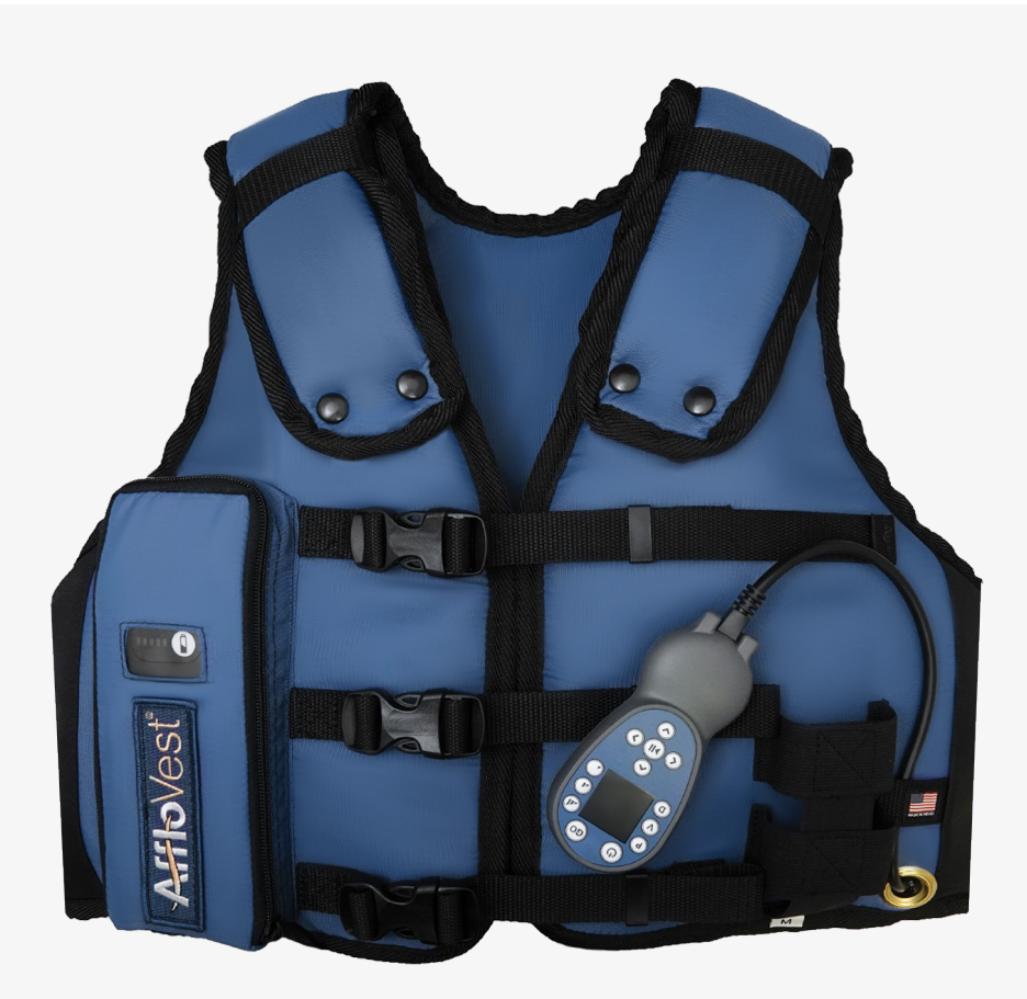
AFFLOVEST <sup>®</sup> MOBILE AIRWAY CLEARANCE THERAPY

Frees patients. Mobilizes secretions. Advances therapy.