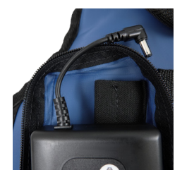
Open battery compartment and disconnect battery as shown, leave disconnected sixty (60) seconds

Wait sixty (60) seconds and reconnect battery. The battery will beep twice when the battery is plugged back in.