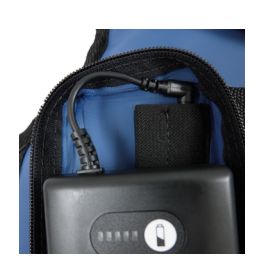
Plug battery back in, controller should beep twice when plugged back into battery