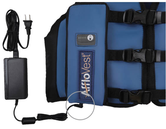
Power supply connected to battery

Next, plug the power supply plug into the AffloVest battery. There is a small opening at the bottom of the battery pouch.